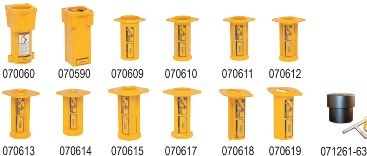
Chart 1 - Master chuck and chuck adapter sizes and part numbers.

Chuck adapters and part numbers. 2.5", 3" and 3.5" Drive Cap Required for driving 2.5", 3" and 3.5" Schedule 40 Pipe. See Chart 1 for size information.