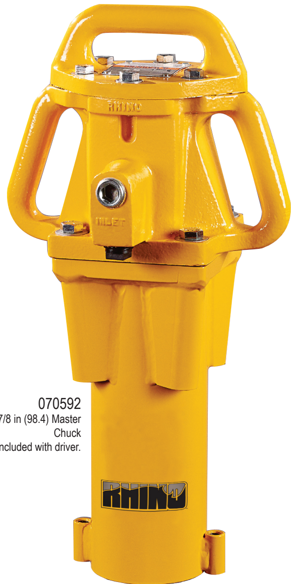
070592 3 7/8 in (98.4) Master Chuck included with driver.

■An optional master chuck is required ●An adapter is required ♦A driving cap is required ♦♦Indicates a combination of accessories is required