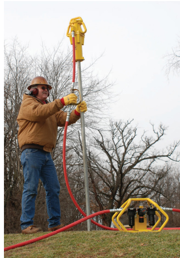
PD-55 shown with FRL and Carrier.