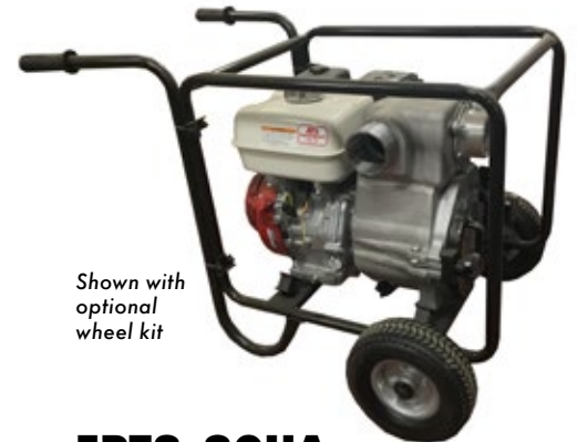
Shown with optional wheel kit