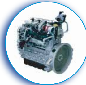
Doosan D24 Engine Reliable and fuel-efficient