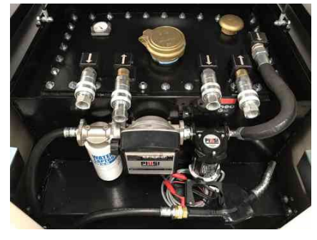
Diesel transfer pump setup