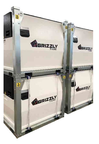
Stack 2 tanks full of fuel for improved storage